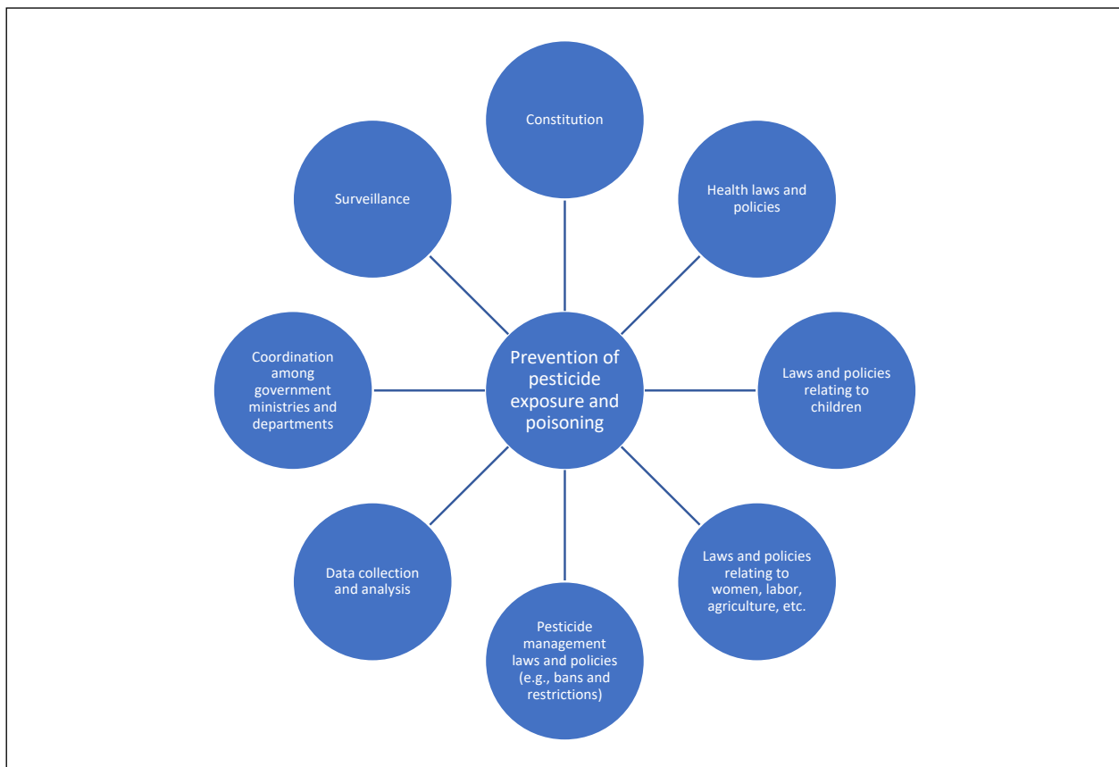
FIGURE 2. Multipronged response

The universality and indivisibility of children's rights are particularly relevant for pesticide poisoning prevention, as children's rights to life and health provide the rationale for stricter pesticide regulation and, ultimately, the phasing out of HHPs. The principle of the best interest of the child points to the need to adopt a human rights-based and child-centered approach to the development and implementation of pesticide management laws and policies. Collaboration among the industry, international bodies, and national decision-makers on strengthening pesticide management is needed to promote a children's rights-based approach. The human rights-based framework discussed in this paper could ensure the integration of the interests of children into relevant domestic laws and policies in different jurisdictions.